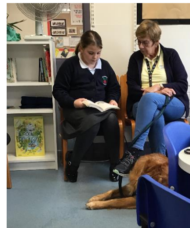
Year 2 and Year 6 busy at work!