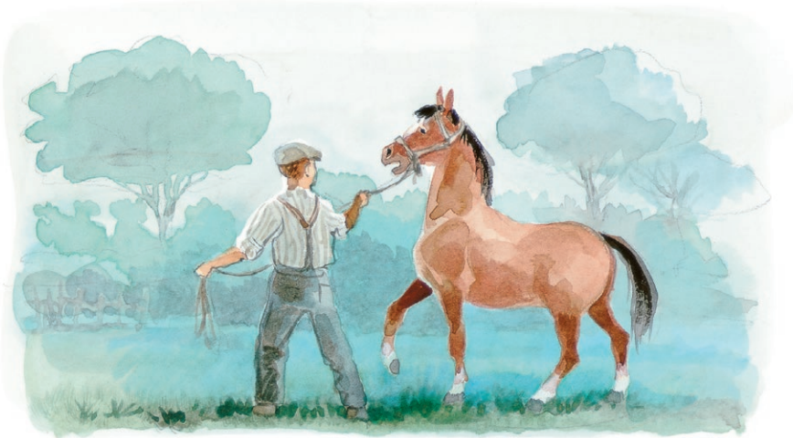
Extract from Chapter 2 of 'War Horse' by Michael Morpurgo.

9 Through the long hard winters and hazy summers that 19 followed, Albert and I grew up together. A yearling colt 29 and a young lad have more in common than awkward 30 gawkishness. 42 Whenever he was not at school in the village, or out at 54 work with his father on the farm, he would lead me out 66 over the fields and down to the flat, thistly marsh by the 77 Torridge river. Here on the only level ground on the farm 87 he began my training, just walking and trotting me up 99 and down, and later on lunging me first one way and then 101 the other.