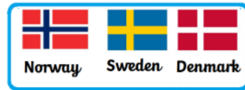
Scandinavian countries' flags